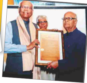
Felicitating of Dr. Raghunath Mashelkar at Goa Fest 2014