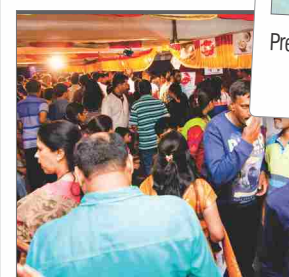
Crowd Enjoying at Goa Fest 2018