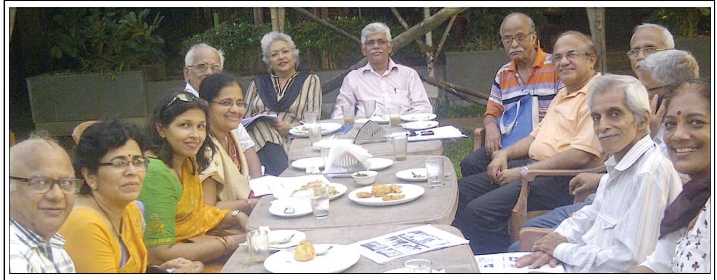
'Aami Goenkar' held its 10th AGM on 28th September, 2014 at Park Club, Dadar.